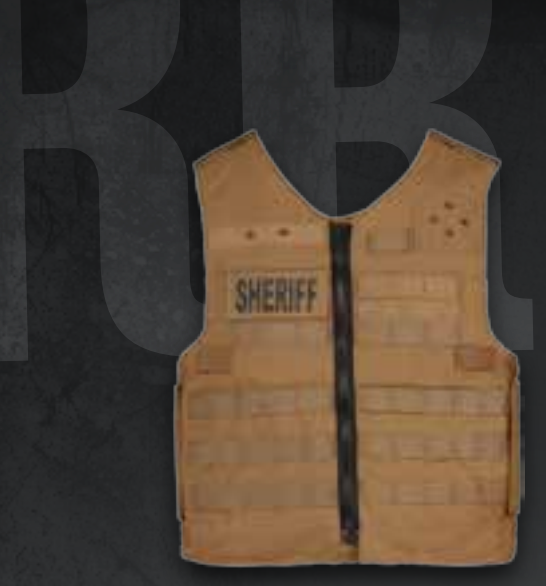
FRONT OPENING RAID MOLLE