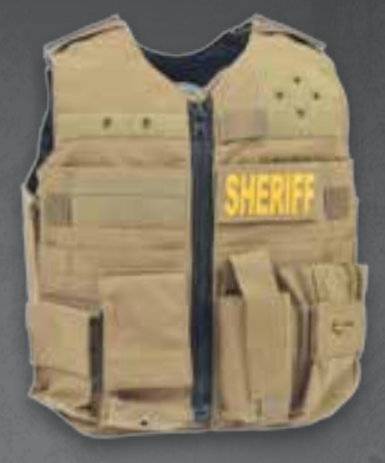
FRONT OPENING RAID SEWN-ON-POCKETS

L-R (as wearing): Handcuff, Radio, Flashlight, Small Utility, Large Utility