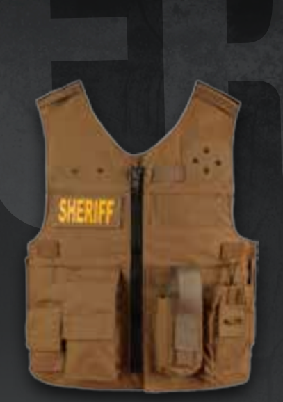
FRONT OPENING RAID SEWN-ON-POCKETS

L-R (as wearing): Radio, Flashlight, Utility and Handcuff