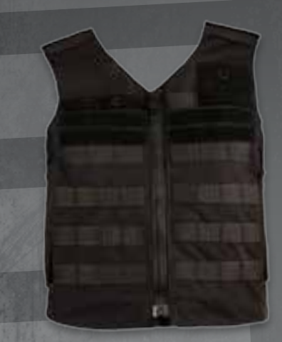
FRONT OPENING RAID MOLLE

L-R (as wearing): Handcuff, Radio, Flashlight, Small Utility, Large Utility