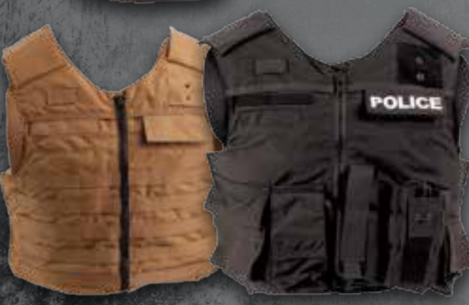
FOT-OC ASSAULT MOLLE